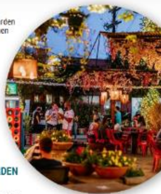
Elsewhere Garden Bar and Kitchen

Fiume [fyoo-me] Pizzeria and Wine Bar, located on the San Antonio River, merges the authentic flavors of Italy with traditional Texas ingredients. The artisan, Texas-crafted pizza incorporates local flavors and features the Neapolitan-style in what they define as Texapoletana. The name Fiume—meaning river—spotlights the San Antonio River, the core of this dynamic, culturally diverse city. Their vision and menu are exemplary of an elevated dining experience revered for its deep local roots and hyperlocal culinary craftsmanship.